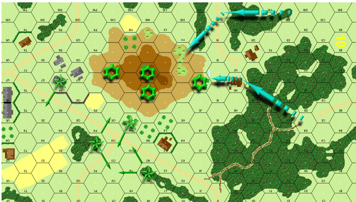
Figure 2: Southern half of playing area. Probable Hungarian entry points and attack routes on the south board edge are marked with blue arrows. Green six-pointed markers indicate possible foxhole positions – the Light Mortar and the MMG with 10-2 leader direction should be in mutually supporting positions on the Level 2 and 3 hill hexes. Green five-pointed stars mark some possible antitank gun locations and some interesting corresponding covered arc hex spines.

The other area to consider is the south side entry of the Hungarian flanking force: it is probably not good to be fighting the Hungarians in the woods but at the fringe of the forest. A 4-4-7, LMG and 8-1 at the point of the hill (see Figure 2) will dominate many of the hill approaches and keep the Hungarians a little more cautious. Keep another squad nearby in case of lucky shots, snipers etc: if these guys go down to some low odds shot, your southern defenses will be compromised and you will swiftly feel the pain of encirclement